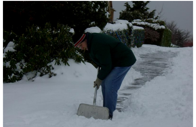
2008- Christmas Snow