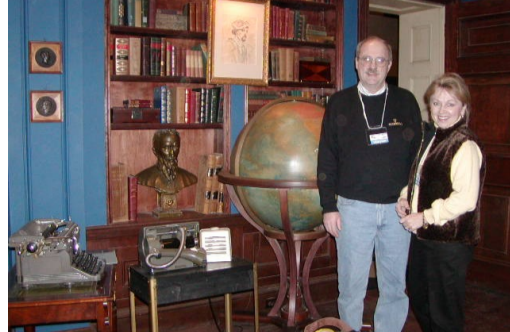
Nero Wolfe Set—Toronto—Mar 2002