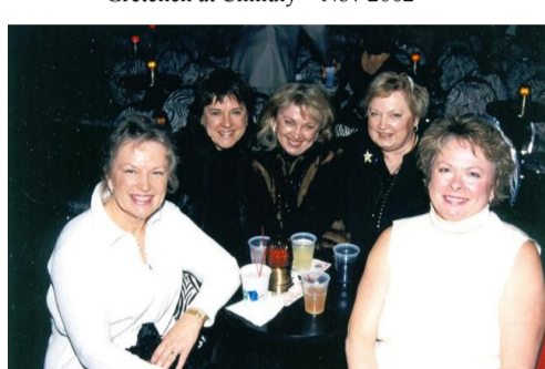
Sisters—Las Vegas Feb 2003