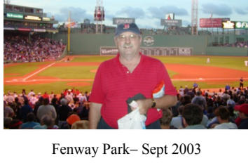
Fenway Park—Sept 2003

There are lots of pictures of these, and other, activities at our website. Please visit it: www.GradyGroup.com