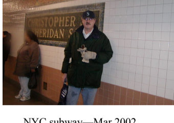
NYC subway—Mar 2002